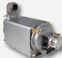
PATENTED HEAT EXCHANGER